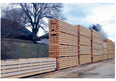
From the woods to the construction material. Timbatec supervises the process.