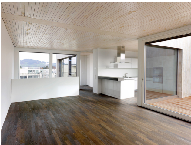
Living room and kitchen