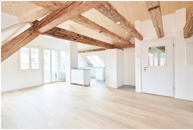
Room with kitchen