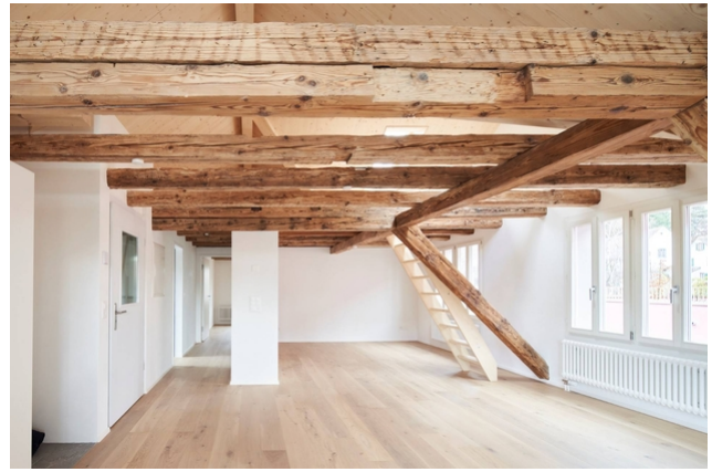
Room (with ascent)