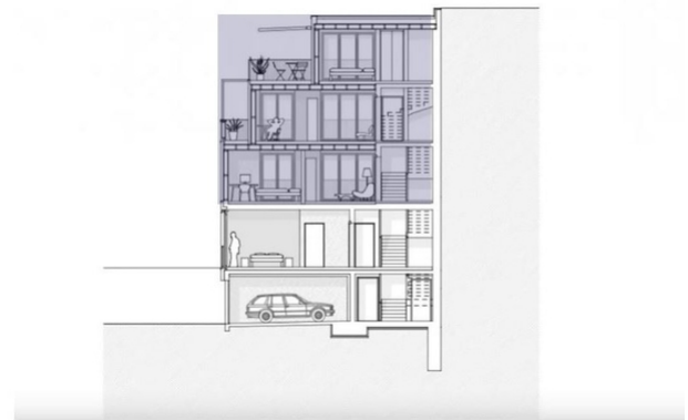
Cross-section of the extension