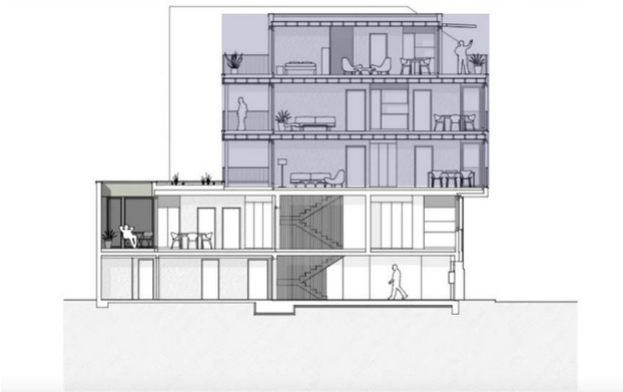
Longitudinal section of the extension