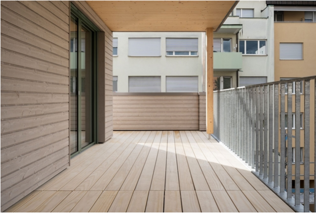
Terrace 3rd floor